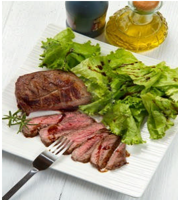
The Red Wines