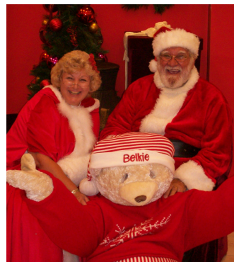
Mr and Mrs Claus with Belkie Bear 2008

ing straight in from the North Pole to enjoy Breakfast with the Children. There will be a Photographer here to take photos. Reservations are required, so plan to make reservations now. Wear your best Holiday Outfits for this Breakfast. We look forward to serving you and your Children for this special Breakfast! See you then... Ho Ho Ho!